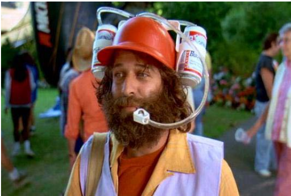
Enjoy Some Refreshments!